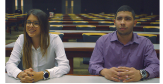
UPR Business Students

When a faculty invests in students, the probability of students experiencing anxiety and depression can be decreased. Recent research in Australia