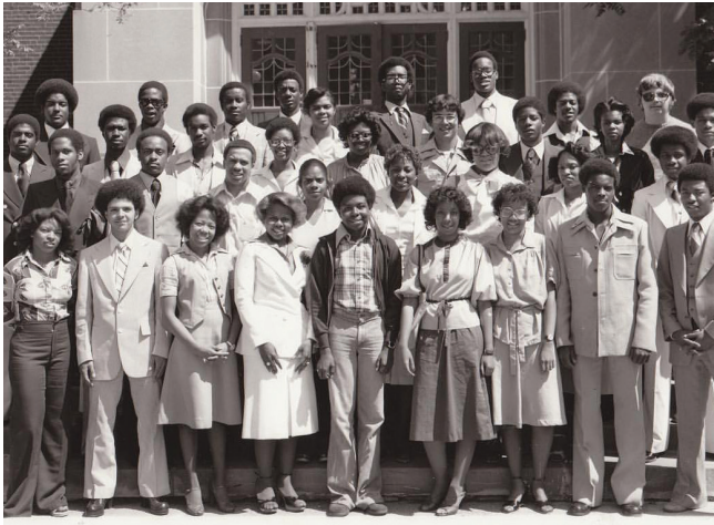
B.O.P. Class of 1978

fourth largest international student population of any university in the United States.