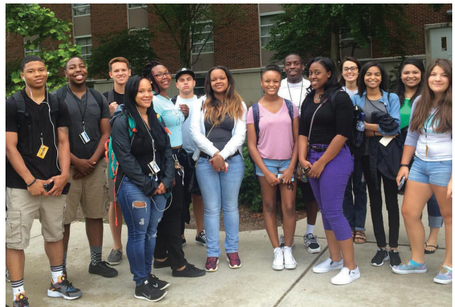
B.O.P. Class of 2015