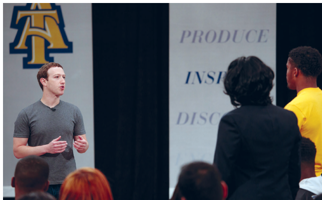
Facebook Founder and CEO Mark Zuckerberg during his visit to N.C. A&T on March 13, 2017.

The N.C. A&T faculty and staff are committed to taking a holistic approach to developing and instilling the values needed to be successful in any organization. Descriptions of the following programs will give you an understanding of best practices, as well as cost-effective workshops that could be implemented on a budget.